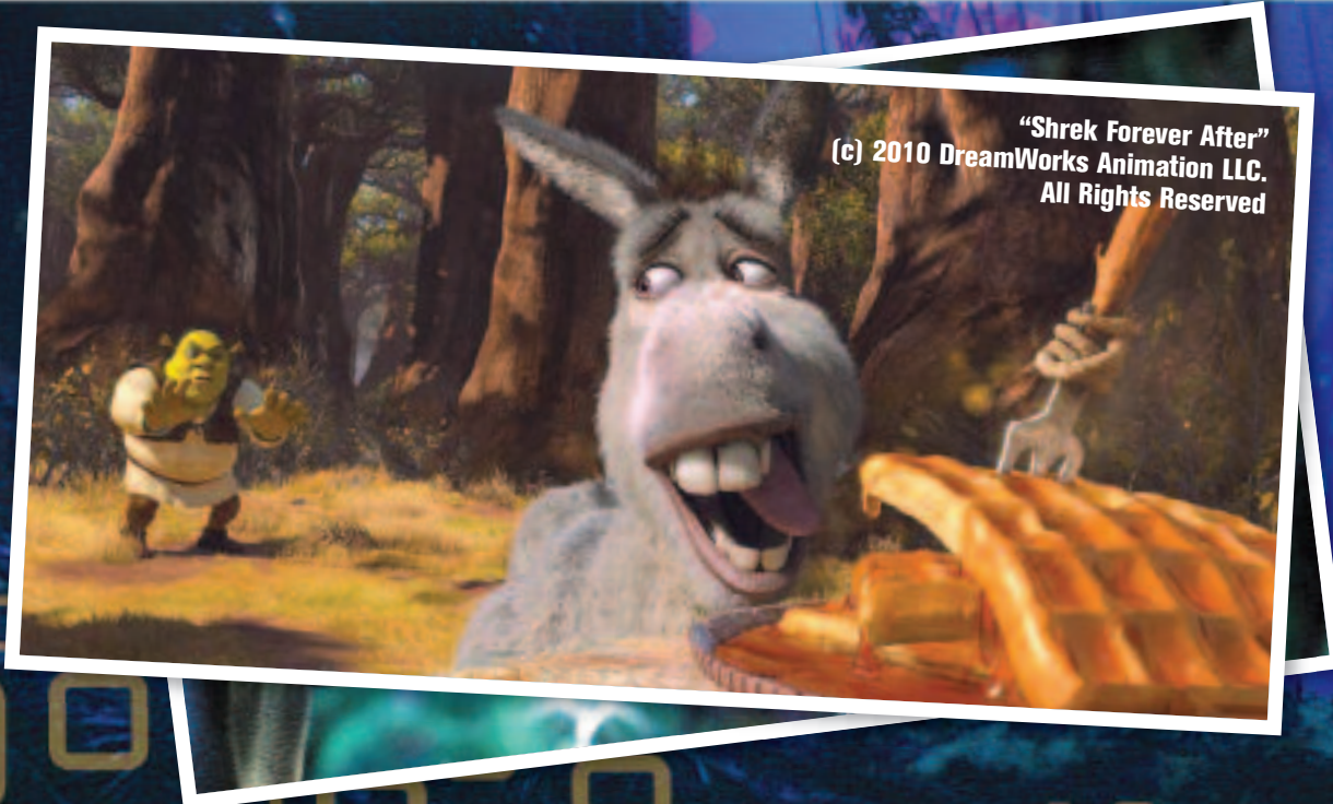
“Shrek Forever After” (c) 2010 DreamWorks Animation LLC. All Rights Reserved