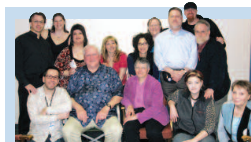
This photo is of members of Locals 476 and 769, hair and make-up and wardrobe crews for Lyric Opera of Chicago.