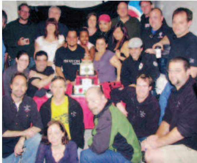
This photo was taken in Orlando before the 7000th show of Phantom of the Opera. In the photo are the road crew and stage management staff.