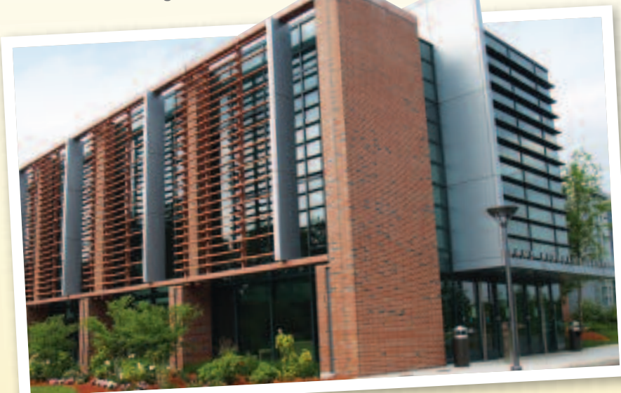
National Labor College Campus

The proposed August workshop will continue the preparation for arbitration, beginning with the same mock case and a streamlined version of the list of best facts and worst facts (again broken down by issue) from the January session. Participants will then use these facts to formulate arguments for each issue in the case. The course is designed to be beneficial to all local representatives, regardless of their level of experience, and will be useful whether or not you attended the January workshop.