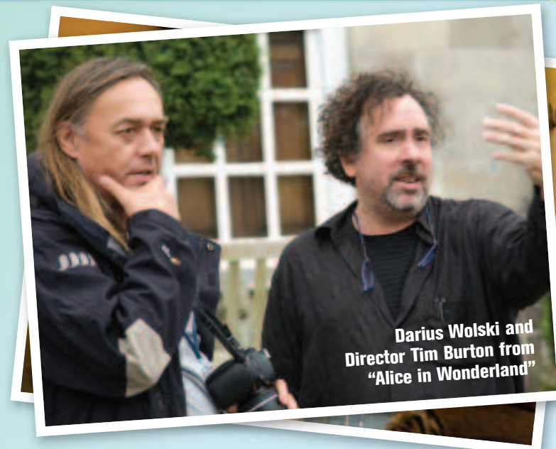
Darius Wolski and Director Tim Burton from “ Alice in Wonderland ”