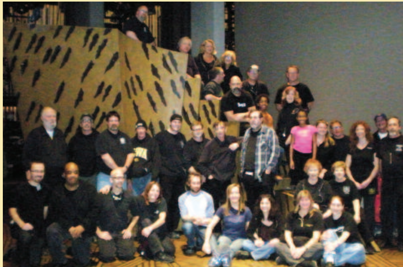
The cast and Local 67 crew from Lion King.